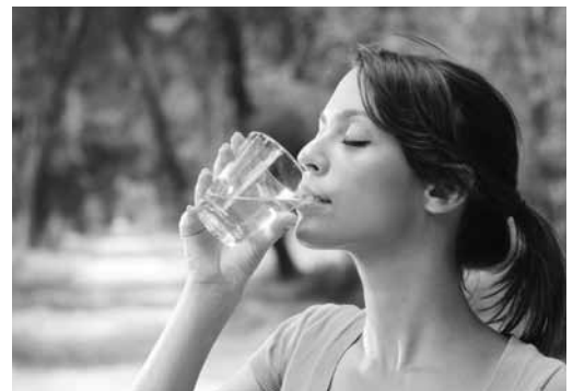
We recommend drinking 8 ounces of water per every 10 pounds of body weight every day while cleansing, and more in warmer weather.